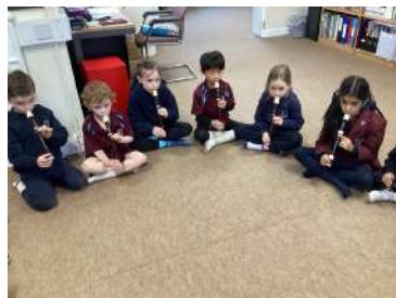
Our music class has been buzzing with creativity as pupils explore rhythms, melodies, and new instruments. Meanwhile, orchestra practice is in full swing, with talented musicians coming together to create something truly special. From solo work to teamwork, it's amazing to see their passion for music grow every day! Bravo to all our young performers!