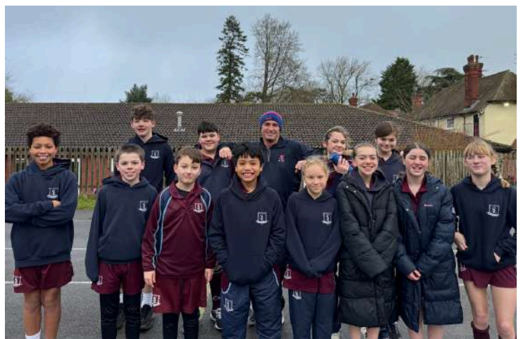
What an energising start to the day! The whole school came together for a lively morning workout, and a big thank you to our Year 2 parents who joined in the fun. A refreshing way to kick off the day!