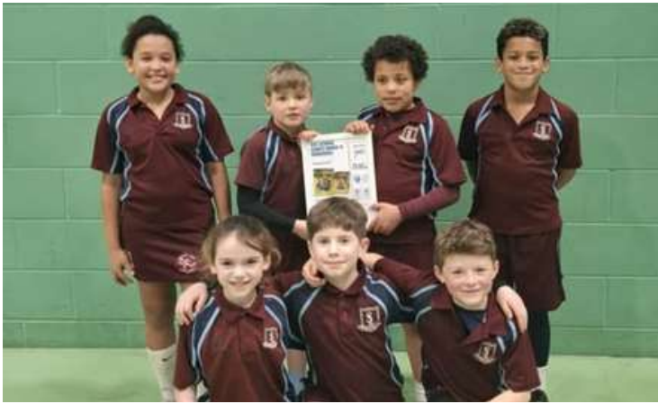
A huge congratulations to our U9 team for their fantastic victory at the West Suffolk Dodgeball Tournament, hosted here at South Lee Prep School yesterday! Competing against 15 other schools, they showed incredible skill, teamwork, and determination to come out on top. Well done, team—what an amazing achievement!