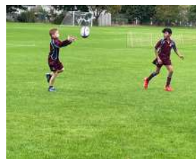
On Wednesday, our Year 11 boys hit the field for an exciting rugby match against St Margaret's – a fantastic show of teamwork and determination!