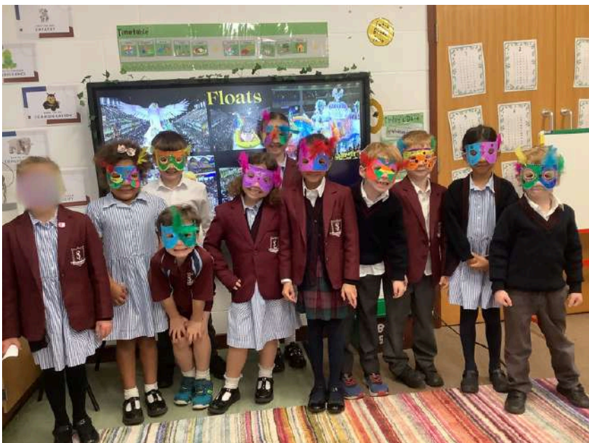
Year 2 had a fantastic day learning all about the lively Brazil Carnival! The children created their own colourful carnival masks – a brilliant burst of creativity!