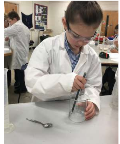
Year 5 have been exploring the saturation point of water with salt! They showed great maturity, even creating their own risk assessments to keep things safe. Fantastic work, young scientists!